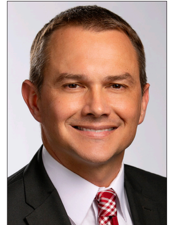
Brandon Hall Safeties