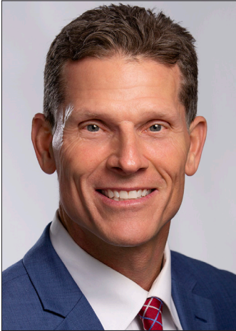
Brent Venables Head Coach