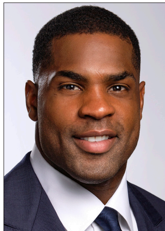
DeMarco Murray Running Backs