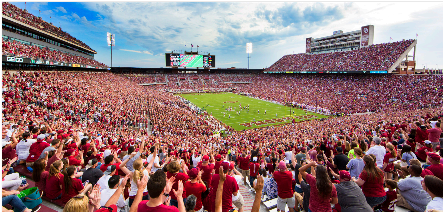
OU's $160 million stadium renovation and modernization project bowled in the south end of the facility and added premium seating and a 62-foot-by-38-foot video board.