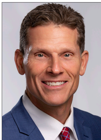
Brent Venables Head Coach