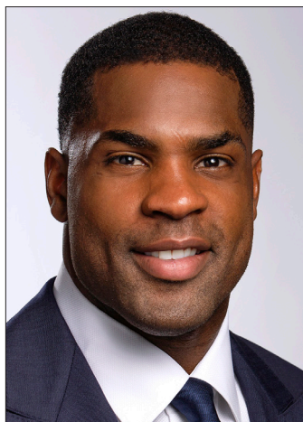
DeMarco Murray Running Backs