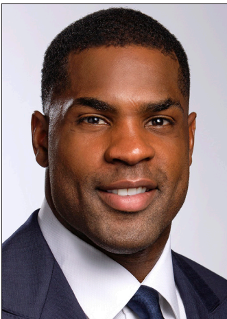
DeMarco Murray Running Backs