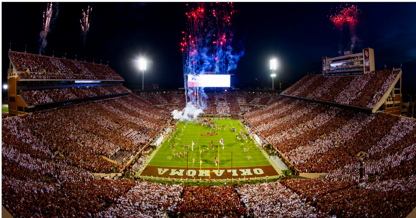
OU's $160 million stadium renovation and modernization project bowled in the south end of the facility and added premium seating and the second-largest collegiate video board.