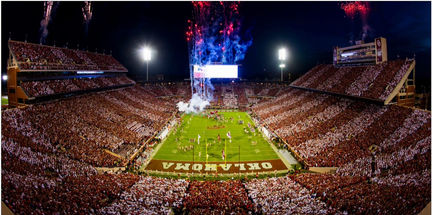
OU's $160 million stadium renovation and modernization project bowled in the south end of the facility and added premium seating and the second-largest collegiate video board.