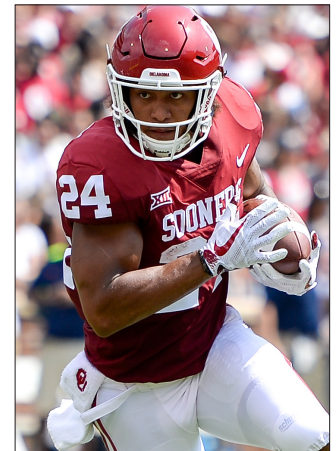
Redshirt sophomore Rodney Anderson has rushed for 195 yards on 29 carries (6.7 average) and two TDs the last two weeks while adding 30 receiving yards and another score. He ran for a career-high 147 yards in OU's 42-35 win at Kansas State on Saturday, scoring on the Sooners' last two possessions (5-yard catch with 5:16 remaining and 22-yard run with 7 seconds left).

► Texas Tech is the alma mater of OU head coach Lincoln Riley . A walk-on QB for the Red Raiders during the spring and summer of 2003, Riley spent seven years (2003-09) on former head coach Mike Leach's TTU staff in the roles of student assistant/offense (2003-05), offensive assistant (2006), wide receivers coach (2007) and inside receivers coach (2008-09). He also served as Tech's interim offensive coordinator and play-caller for the 2010 Alamo Bowl, a 41-31 victory over Michigan State. OU