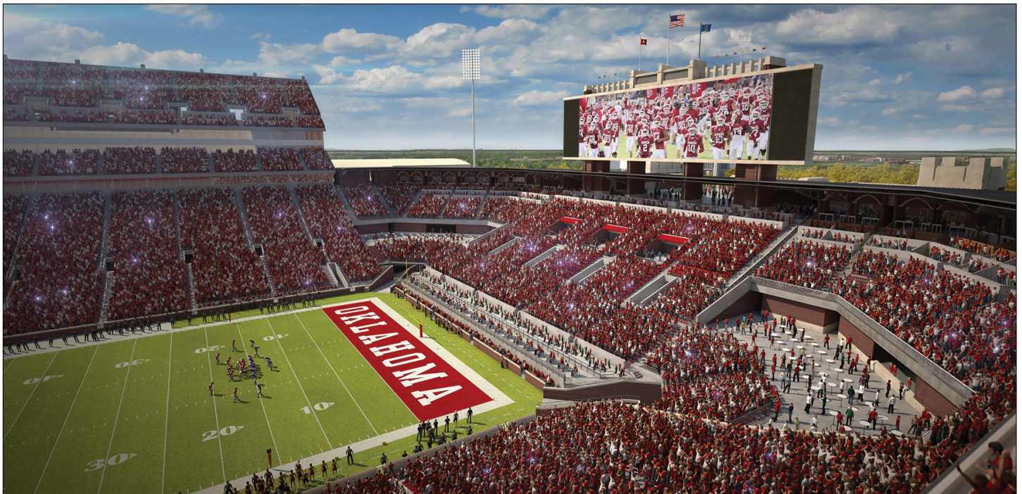
OU's $160 million stadium renovation and modernization project will bowl in the south end of the facility and is slated to be completed in time for the 2016 season.